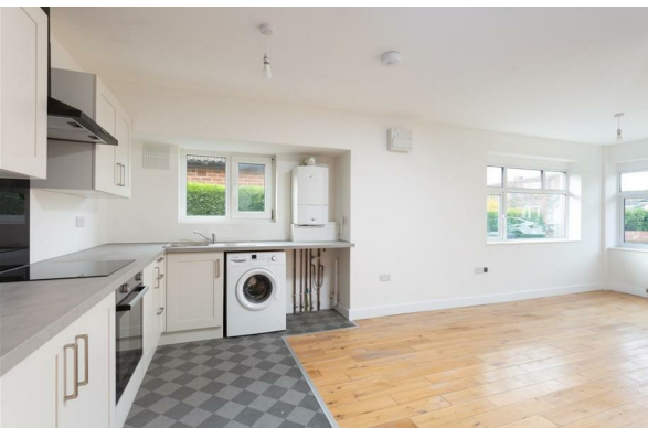
Chantry Avenue, Poppleton, York, YO26 6DJ